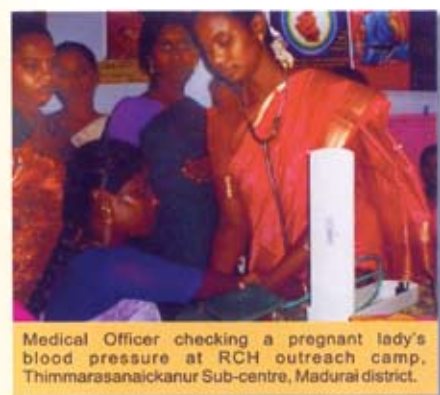
Medical Officer checking a pregnant lady's blood pressure at RCH outreach camp, Thimmarasanaikanur Sub-centre, Madurai district.